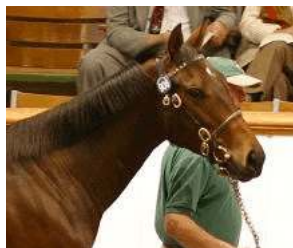
Lot 906 - Oasis Dream filly www.tattersalls.com