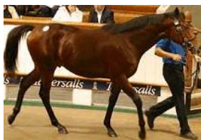
Lot 904 - Halling colt www.tattersalls.com