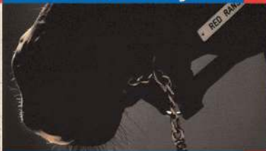
Red Ransom: 330k colt