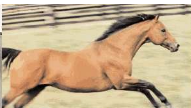
Dubai Destination: 625k colt