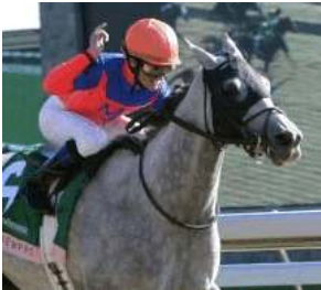
Asi Siembre