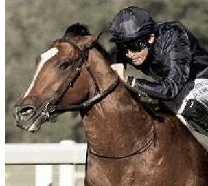
George Washington