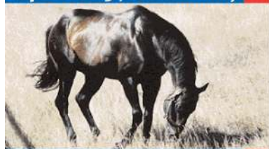
Green Desert: 240k colt