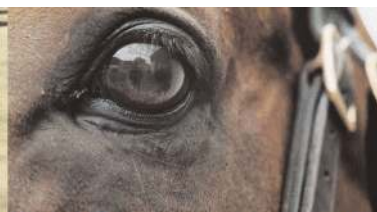
King's Best: 260k colt