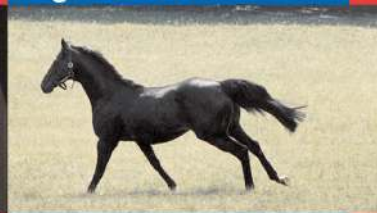
Singspiel: 190k filly

They say breeding horses is a numbers game. Tatts proved one thing above all else: this is the number you need: +44 (0)1638 730070.