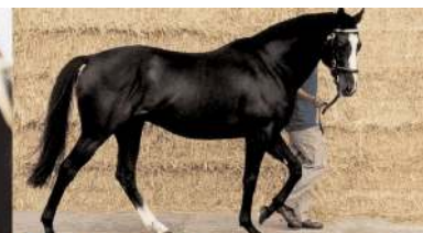
Diktat: 340k filly