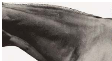
Cape Cross: 340k colt and filly