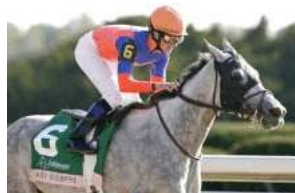
Asi Siempre

Asi Siempre made a good first impression in her U.S. bow, finishing second in the 2005 GI Garden City Breeders' Cup S. after beginning her career in France. The gray closed out her sophomore campaign with a victory in Keeneland's GIII Valley View S. Oct. 21 and kicked off the new year with a second-place finish in that track's GII Jenny Wiley S. Apr. 15. She turned in consecutive fourth-place finishes at Belmont in the GII Sheepshead Bay H. May 27 and the GII New York Breeders' Cup H. June 24, but got back on track at Saratoga with a victory in the De La Rose S. Aug. 9. Last seen rallying to finish third in Saratoga's GII Ballston Spa H. Aug. 26, she was sent off as the third choice in the Spinster, but proved best. Click for the brisnet.com chart or the free brisnet.com catalogue-style pedigree . Video, sponsored by Taylor Made.