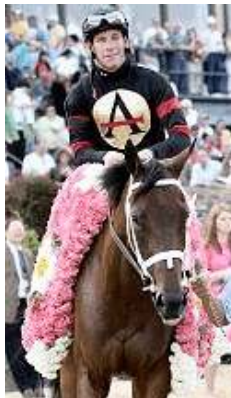
Spun Sugar

Winner of the GII Black Eyed Susan S. and three times placed in Grade I company at three, Spun Sugar was sidelined for more than six months after running second in the GI Alabama S. at Saratoga. She returned to take an optional claimer at Gulfstream Park in March before breaking through at the highest level, besting Happy Ticket by a neck in the Apr. 8 GI Apple Blossom H. at Oaklawn Park. The even-money chalk in the June 17 GI Ogden Phipps H., the bay bobbed at the break and ended up fourth, but she atoned for that loss with a game nose decision over Balletto (UAE) in the July 30 GI Go for Wand S. at Saratoga. Happy Ticket came back after her narrow