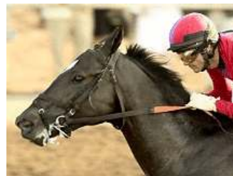
Principle Secret

Undeclared Principle Secret stretches out after an impressive maiden score at Del Mar July 22 and a three-length tally in the GII Best Pal S. at that track Aug. 13. The dark bay prepped with a six-furlong work at Hollywood Sept. 23, getting the distance in 1:13, fastest of 29 at the distance. Horse Greeley finished second to Principle Secret in his debut and came back to win by four in an Aug. 12 maiden test. He added a victory in the Sept. 6 GII Del Mar Futurity going seven furlongs and has worked sharply since, firing a bullet five furlongs in :58 3/5 at Santa Anita Oct. 3. Spot the Diplomat takes on open company in quest of his fourth consecutive success. The chestnut gelding wired the field in his latest, the six-furlong I'm Smokin S. at Del Mar Sept. 4. Malt Magic romped by 9 1/2 lengths when trying a mile at Del Mar the same afternoon.