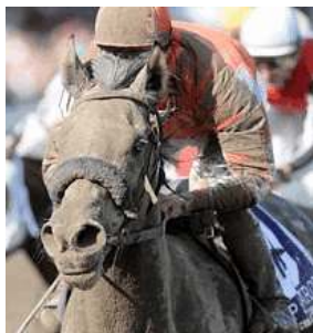
Swap Fliparoo