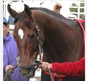
Saint Liam (2000-2006) 2005 Horse of the Year