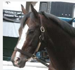
Lost in the Fog (2002-2006) 2005 Sprint Champ