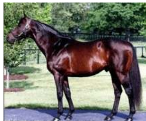
Seeking the Gold claibornefarm.com

The list of sires represented reads like a "who's who" of the industry, including stars such as Baratheia (Ire), Cape Cross (Ire), Danehill Dancer (Ire), Dr Fong, Elusive Quality, Fasliyev, Forest Wildcat, Galileo (Ire), Giant's Causeway, Gone West, Green Desert, Hennessy, Indian