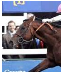
Rail Link