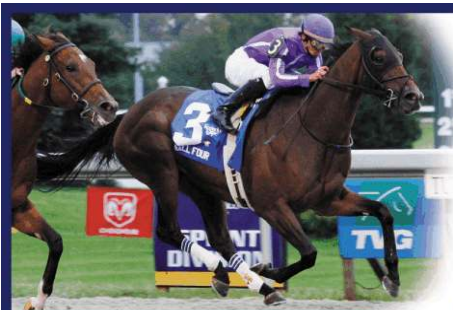
BALL FOUR wins the Kentucky Cup Classic Stakes-Gr.2 last Saturday

9 stakes winners in 2006 including Grade 2 winner BALL FOUR