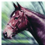
Officer G1 Winner at 2

© Copyright Thoroughbred Daily News. This newspaper may not be reproduced in any form or by any means, electronic or mechanical, without prior written permission of the copyright owner, MediaVista. Information as to the American races, race results and earnings was obtained from results charts published in Daily Racing Form and utilized here with with the permission of the copyright owner, Daily Racing Form.