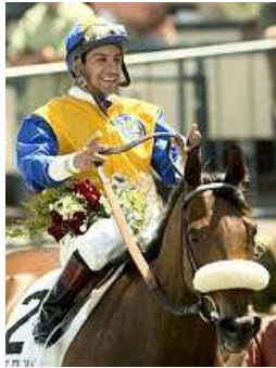
The Tin Man