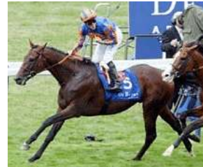
Hurricane Run