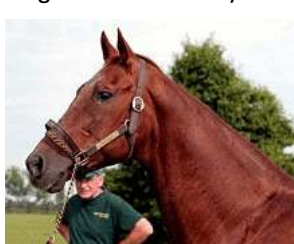
Precisionist arriving at Old Friends in June

CHAMPION PRECISIONIST EUTHANIZED Cham- pion Precisionist (Crozier--Excellently, by *Forli), a member of racing's Hall of Fame, was euthanized yes- terday at Old Friends near Georgetown, Kentucky, according to The Blood-Horse . The 25-year-old was suffering from an inoperable tumor in his sinus pas- sages. "Yesterday he looked at me and said, 'It is time,'"