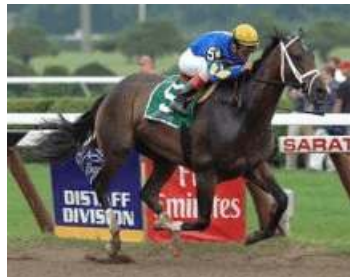
Ashado, last year's $9-million record topper at Keeneland

5,026 CATALOGED FOR KEENOV Keeneland announced yesterday that it has cataloged 5,026 for its annual November Breeding Stock Sale, set to run 14