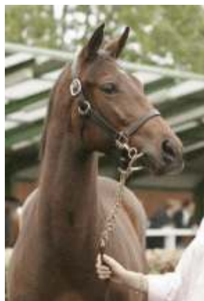
Hip 105, Tuesday's topper

Ballymacoll Stud's outstanding family of Hellenic (Ire) was at the forefront of yesterday's trading during an exceptional opening session of the Goffs Million Sale. A filly named Dune (Ire), the daughter of Darley's Red