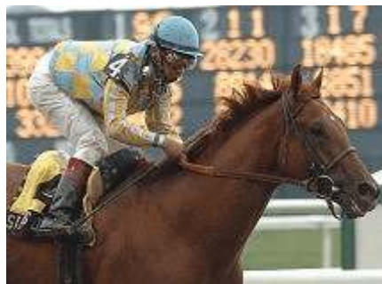
Strong Contender