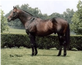
Deputy Commander

DEPUTY COMMANDER TO CALIFORNIA The 12-year-old stallion Deputy Commander (Deputy Minister--Anka Germania {Ire}), by Malinowski) has been purchased by Ballena Vista Farm in Ramona, California, where he will stand the 2007 breeding season for a fee of $10,500. Deputy Commander previously stood at Kentucky's Airdrie Stud, where his 2006 fee was $10,000. Winner of the GI Travers S. and GI Super Derby as a three-year-old of 1997, Deputy Commander has sired 29