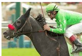
Cambiocorsa Benoit photo

The Oak Tree meeting at Santa Anita kicks off today, with this crowded event as the opening-day feature. The well-deserved highweight at 122 pounds is