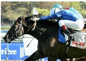
Court Masterpiece