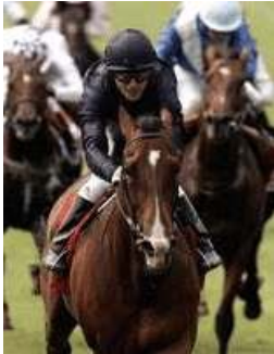
Dylan Thomas

Dylan Thomas (Danehill), who is slated to contest the GI Breeders' Cup Classic at Churchill Downs Nov. 4, is expected to prep for the $4-million race in the United States, according to Aidan O'Brien. "We have entered