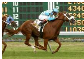
Ready's Gal

Ready's Gal and Ready to Please are, respectively, from the first and second crops of More Than Ready.