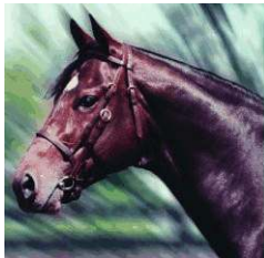
OFFICER G1 Winner at 2 including the Champagne S.-G1, Del Mar Futurity-G2, etc.