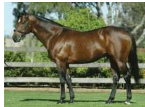
Danehill Dancer , sire of winner stallions.com.au

The scratching of Arcadio (Ger) (Monsun {Ger}) took much of the edge off this contest, but the tough and consistent filly Nordtanzerin put back dome gloss when striking for the Classic generation.