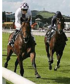
Teofilo (left)