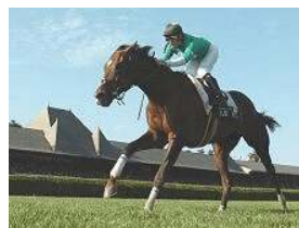
Remarkable News

Last season Leroidesanimaux (Brz) left little doubt who the best turf horse in the nation was with a