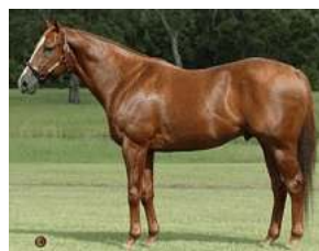
Red Bullet www.stallionregister.com

Hip 1505, a colt from the second crop of 2000 GI Preakness S. hero Red Bullet, was hammered down to Centennial Farms for a whopping $390,000 around midday yesterday. Consigned by Craig and Holly