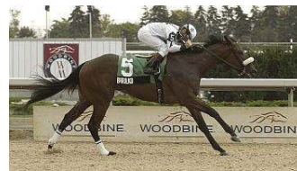
Barilko

Barilko--named after the late Toronto Maple Leafs star Bill Barilko--maintained his unbeaten record with his