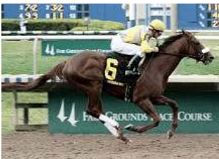
Wanderin Boy

Today's GII Brooklyn Breeders' Cup H. at Belmont, repositioned from its usual spot during the spring/summer meeting, has drawn a competitive field of seven, even if East Coast stars Bernardini and Invador (Arg) are awaiting next month's GI Jockey Club Gold Cup. Wanderin Boy (Seeking the Gold) rolled to victory in a pair of Keeneland starts in April, including the GIII Ben Ali S. Apr. 27, before losing late to Invador as the 4-5 chalk in the GI Pimlico Special May 19. The lightly raced five-year-old rebounded with a daylight win