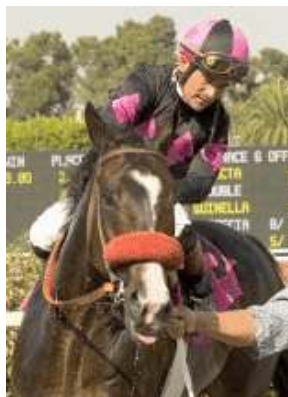
Lava Man

Top older horse Lava Man (Slew City Slew) will remain at his Hollywood Park base while he prepares for the Nov. 4 GI Breeders' Cup Classic. Trainer Doug O'Neill had expressed concern about training his star over the new artificial surface immediately following Lava Man's victory in the GI Pacific Classic Aug. 20, but has changed his mind after watching horses train over Hollywood's new Cushion Track. "I love it," O'Neill told Daily Racing Form . "Visually, it looks the same as the old surface. It's the same color. Horses just seem to skip over it. I worked about 15 or 20