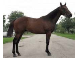
Hip 1077

Tucked away in barn 42, one of the furthest from the action in the Keeneland sales pavilion, is the small three-horse consignment of Nuckols Farm, a Midway operation that prides itself on its hands-on approach and especially for raising the majority of what it sells. Fittingly, all three yearlings in the Nuckols Farm Book 2 consignment are by the popular stallion Distorted Humor, who as a youngster was raised at Nuckols Farm and who went on to win four