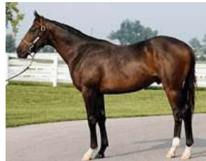
The $9.2-million Danzig on the farm