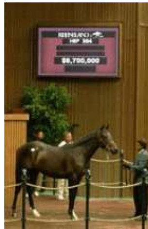
The $9.7-million sales-topper in 2005 millridge.com

A record 5,161 yearlings have been catalogued for the Keeneland September Yearling Sale, which gets underway this morning in Lexington. The catalogue for the 15-day auction--which includes a dark day Friday, Sept. 15--is the largest in Keeneland history, surpassing the previous record of 5,111 which were booked for the 2001 November Breeding Stock sale. The number of horses catalogued for this year's event is 51 greater than the September record 5,110 which were set to go under the hammer last year, and includes 2,704 colts and 2,457 fillies. "The September Yearling Sale is the ultimate Thoroughbred yearling auction," commented Geoffrey Russell, Keeneland's director of sales. "It offers an unparalleled selection of quality individuals at all levels of the market, allowing buyers to fill their orders at one location." He continues, "Such strong participation from buyers--both principals and representatives--from every corner of the world makes Keeneland September the global marketplace for yearlings."