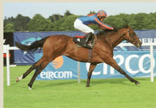
King Hesperus wins Rochestown S. (L)