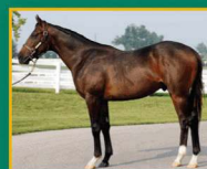
Hip 312 colt by Danzig o/o Sharp Minister (Deputy Minister)

977 Harp Innis, Lexington, KY 40511 Phone: (859) 293-6190 E-mail: info@monticule.com