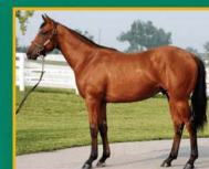
Hip 427 colt by Danzig o/o Crystal Downs (Alleged)