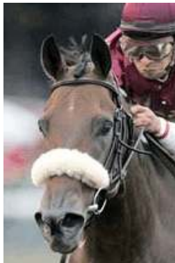
Dubai Escapade