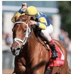
Pool Land

Take d'Tour and Pool Land duked it out on the front end in the July 30 GI Go for Wand H. going nine panels at Saratoga, with Take d'Tour fading to fourth and Pool Land hanging in there for third. Who will have the upper hand today? Pool Land, five-for-seven lifetime, was