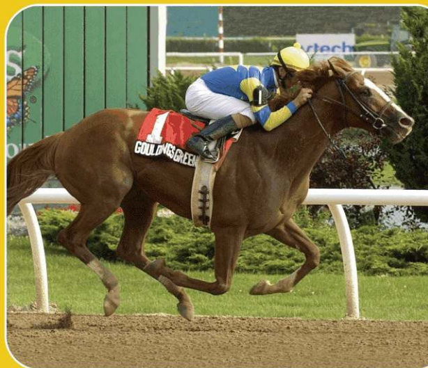
Gouldings Green - Multiple Graded stakes winner 2006

Fewest horses sold of any top five consignor of 2005; More Graded stakes winners from yearling sales than all but four in 2006.