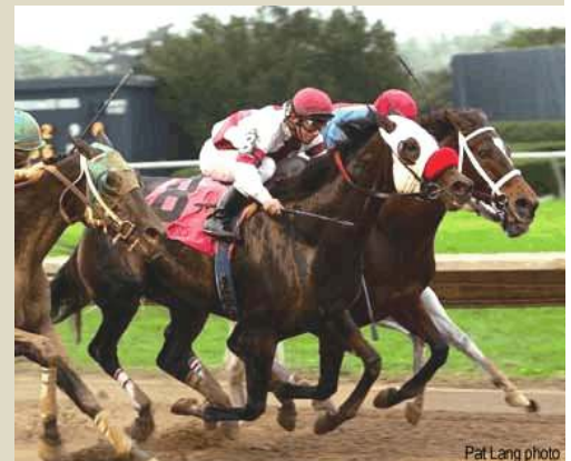
Summer Mis wins 2003 Thoroughbred Club of America S. (G3)