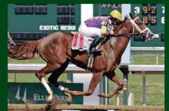
1st Crop SW Cowgirls Don't Cry