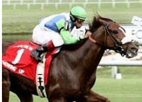
Showing Up

There's no doubt that Showing Up (Strategic Mission) is a very talented animal, but he will certainly have his work cut out for him facing older horses in today's GI Man O' War S. at Belmont Park. The three-year-old opened his account with three straight victories before finishing a respectable sixth in the GI Kentucky Derby. He was switched to the turf for his next two starts and hasn't tasted defeat since, winning the $1-million Colonial Turf Cup June 24 and