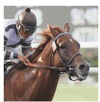
Horse Greeley

The last two Eclipse Award-winning juvenile males, Stevie Wonderboy (2005) and Declan's Moon (2004), each captured the GII Del Mar Futurity on their way to