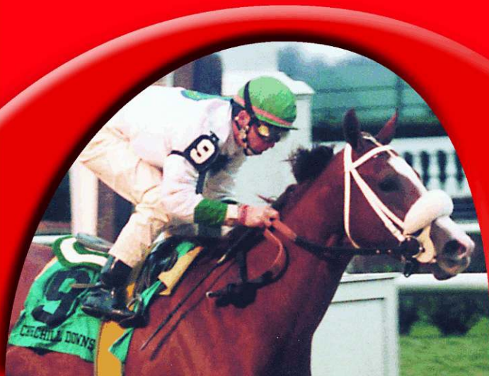
Out of G1 Winner CITY BAND