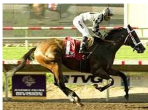
Untouchable Talent

The well-bred Untouched Talent has lived up to her name thus far in her young career. Purchased for $500,000 as a BESMAR juvenile, the Storm Cat daughter of MGSW Parade Queen (A.P. Indy) annexed Pleasanton's July 1 Juan Gonzalez Memorial S. in her very first start. Made the 3-2 choice when stepped up in class to the Aug. 5 GIII Sorrento S., she took her initial graded win by three lengths with something left