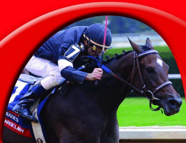
First Foal of G1 Winner TAKE CHARGE LADY