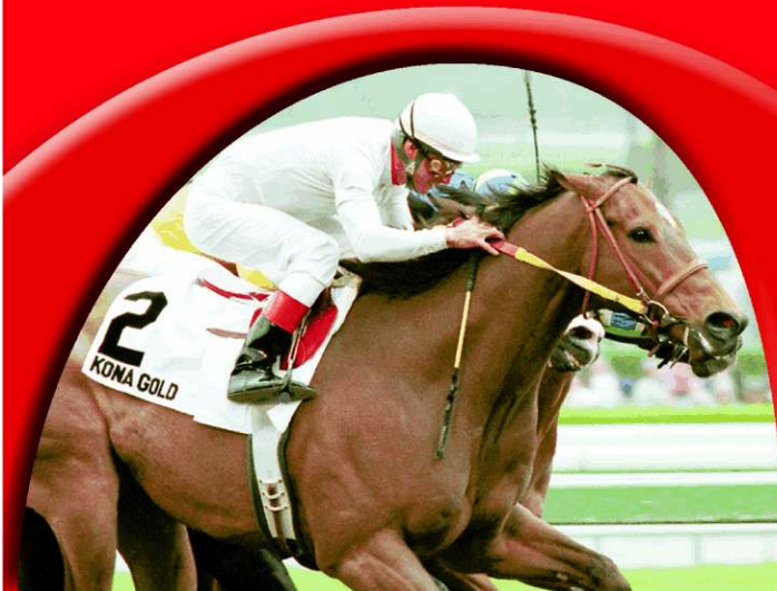
Half sister to Champion Sprinter KONA GOLD