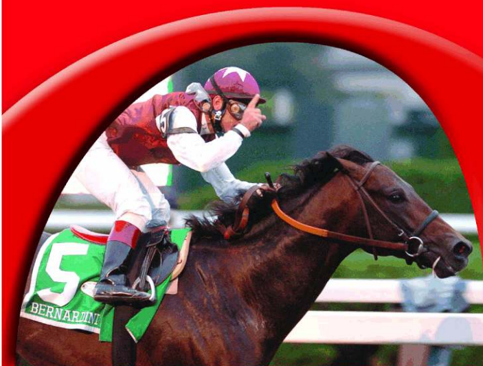
By A.P. INDY Champion sire of the outstanding 3YO BERNARDINI