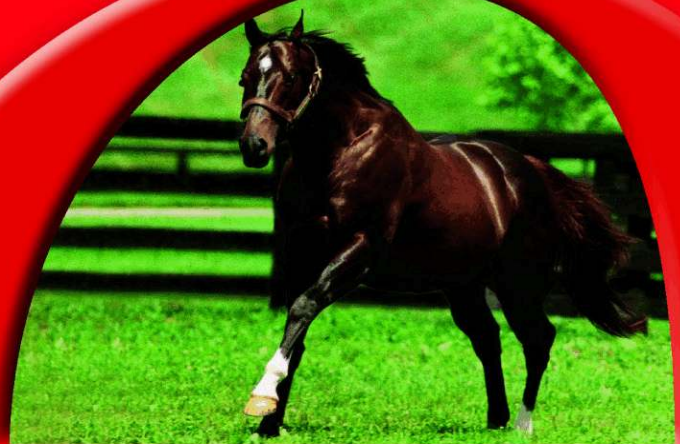
By Sire of Sires STORM CAT