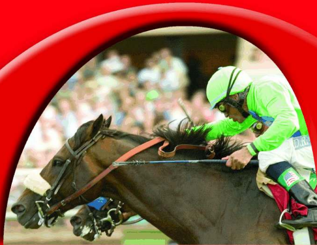
A.P. WARRIOR winning the La Jolla H.-G2 on 8-12