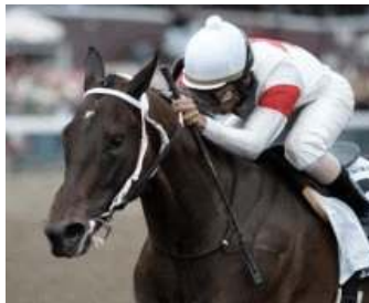
Appealing Zophie

Heiligbrodt Stable's Appealing Zophie (Successful Appeal) staked her claim as the leading two-year-old filly on the East Coast with a compelling performance in yesterday's G1 Spinaway S. at Saratoga. After opening her account with a 10 1/2-length win at Keeneland in mid-April, the dark bay suffered a minor setback when second to Change Up in the Aug. 6 Mountaineer Juvenile Fillies S. But she proved her debut was no fluke in the seven-furlong Spinaway, drawing off to prevail by 5 1/4 lengths over favored Cotton Blossom (Broken Vow). "I thought that was a very good filly that beat her at Mountaineer," said winning trainer Scott Blasi. "We hadn't run in a long time and probably didn't have her tight enough." Cont. p2