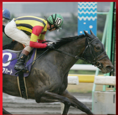
Grab Your Heart-G3