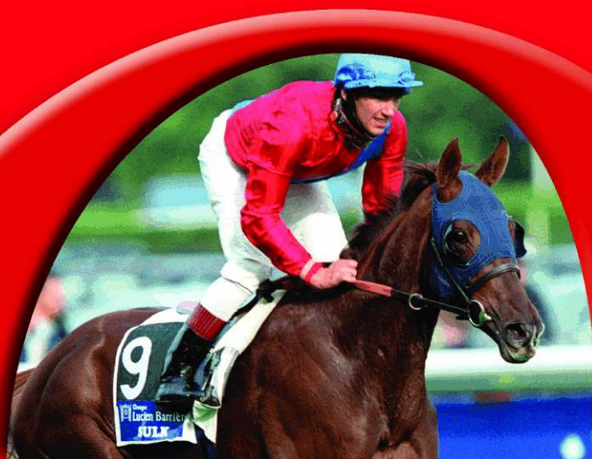
The Dam of Hip #105, Champion SULK