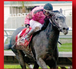
Cause to Believe-G3