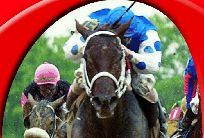
KY Derby & Preakness Winner SMARTY JONES