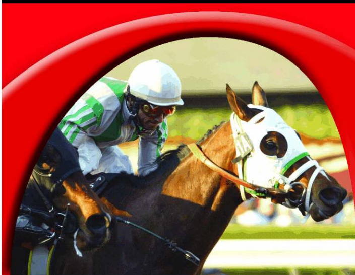
Full brother to G2 sw CAT FIGHTER