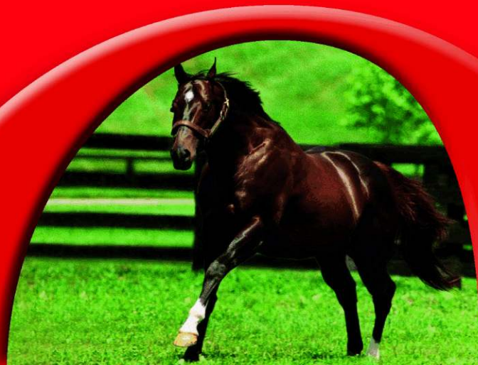
By Sire of Sires STORM CAT