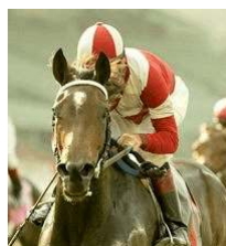
Mea Domina in 2005

In 2005, Mea Domina had parlayed her front-running style to victories in the GI Gamely Breeders' Cup H. at