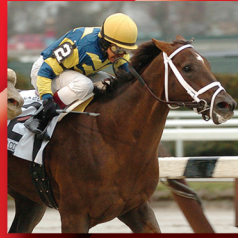
Bishop Court Hill-G1