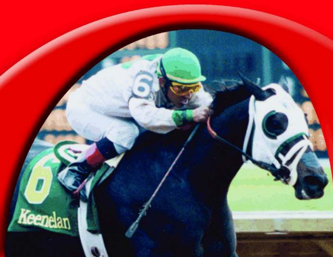
3/4 Brother to Multiple GSW KATZ ME IF YOU CAN