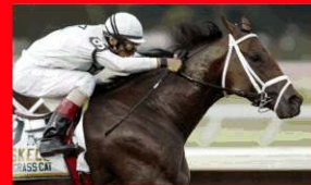
Bluegrass Cat winning the Haskell Inv.-G1

out of A.O.L. HAYES a young daughter of A.P. INDY , the grandsire of BLUEGRASS CAT