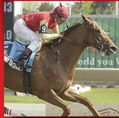
High Button Shoes-G3