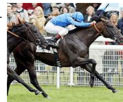
Librettist