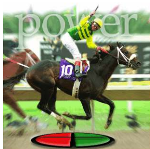
Champion Orientate shown winning the Breeders' Cup Sprint-G1

CORRECTION... Yesterday's TDN incorrectly listed the lifetime record of GI Ballerina Breeders' Cup S. winner Dubai Escapade (Awesome Again). The four-year-old filly's lifetime record is 8-6-0-0, $427,050. We regret the error.