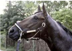
Sun King