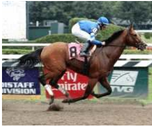
Discreet Cat