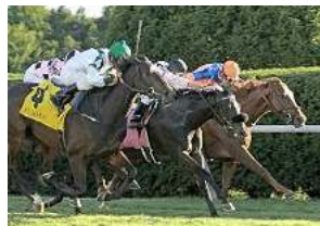
Sweet Talker (ctr) defeating Gorella & Karen's Caper

Sweet Talker , winner of the GI Queen Elizabeth II Challenge Cup S. last October at Keeneland, kicked off