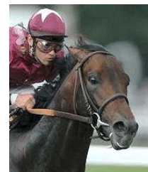
Bernardini