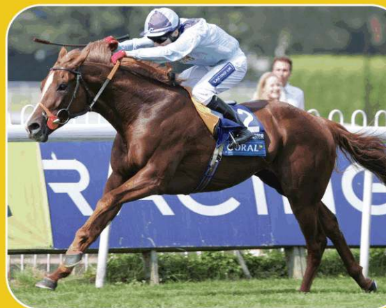
Champion DAVID JUNIOR - 2006 Coral-Eclipse S.-GI

Only three consignors have more 2006 Graded SWs from yearling sales than we do.