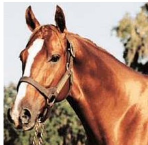
Red Bullet adenastallions.com

RED BULLET YEARLINGS TOP OBS OPEN A filly by freshman sire Red Bullet brought $60,000 to top