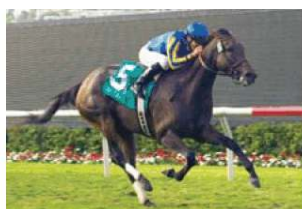
Del Mar Oaks-G1 winner ARRAVALE