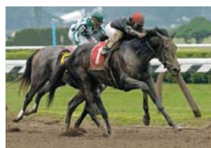
Alabama-G1 winner PINE ISLAND