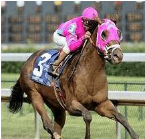
Saint Liam