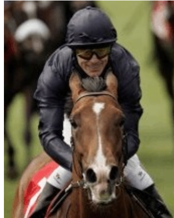
Dylan Thomas's Irish Derby