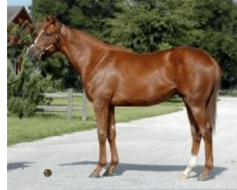
Hip 220 - Monday's Topper

SMART STRIKE COLT TOPS OBS SELECT The Ocala Breeders' Sales Company's August Sale got off to