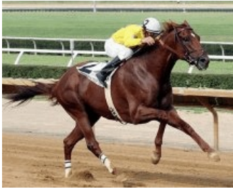
Bright One winning the West Virginia Derby