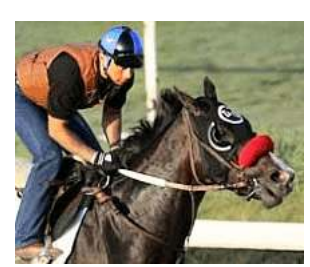
Lava Man

Multiple Grade I winner Lava Man (Slew City Slew). unbeaten in five attempts this season, takes on seven foes in today's $1-million GI Pacific Classic at Del Mar.