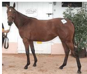
Lot 93