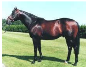
Green Desert www.darley.co.uk

Green Desert (Danzig--Foreign Courier, by Sir Ivor) will join the Darley roster for the 2007 breeding season, according to a press release. The 23-year-old stallion has sired 12 Group 1 winners, including fellow Darley stallion Cape Cross (Ire). He will remain at Nunnery Stud in Norfolk. Also added to the Darley roster for next year are Cadeaux Genereux (GB) (Young Generation {Ire}--Smarten Up {GB}, by Sharpen Up {GB}), Key of Luck (Chief's Crown--Balbonella {Fr}, by Gay Mecene) and Royal Applause (GB) (Waajib {Ire}--Flying Melody {Ire}, by Auction Ring).