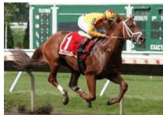
Henny Hughes

Songster (Songandaprayer) and Henny Hughes (Hennessy) each turned in their final preps yesterday morning for next Saturday's GI King's Bishop S. at Saratoga. Songster, owned by Sheikh Mohammed's Darley Stable, went a half-mile over the main track in