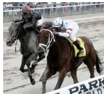
Pine Island chases home Wonder Lady Anne L in the CCA Oaks