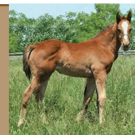
Click here for larger image