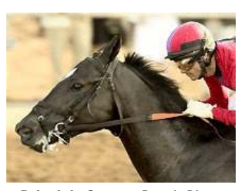
Principle Secret

record to the one which Sea of Secrets boasted as a juvenile, although he didn't make his first start until mid-October of his two-year-old season. Sea of Secrets extended his unbeaten record on his three-year-old debut with a win in the GII San Vicente S. After disappointing in his next