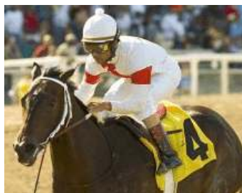
Richwoman

She's made just three career starts, but the undefeated two-year-old filly Richwoman (Successful Appeal) has already logged a few frequent-flyer miles this season. After breaking her maiden at Keeneland in April