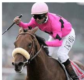
High Limit