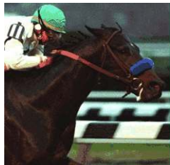
Mr. Greeley... SIRE OF SIRE El Corredor, G1 Winner and Leading Freshman and Sophomore Sire