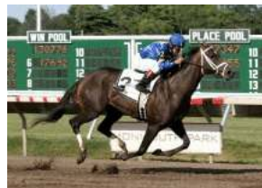
Mo Cuishle