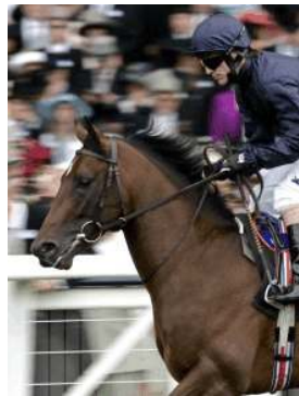
Holy Roman Emperor

According to the script of the G1 Independent Waterford Wedgwood Phoenix S., Aidan O'Brien's is the method of choice. The Ballydoyle trainer had saddled seven of the last eight winners of the six-furlong contest and he extended that streak yesterday as Holy Roman Emperor (Ire) (Danehill) plundered the latest renewal in impressively, earning a possible crack at next weekend's G1 Prix Morny at Deauville. Allowed to start as the 13-8 joint-favorite, Susan Magnier's colt gained revenge on G2 Coventry S. conqueror and market rival Hellvelyn (GB) (Ishiguru) by a decisive 1 3/4 lengths. "Kieren [Fallon] gave him a great ride and, when the split came, he flew through," O'Brien said. Cont. p2