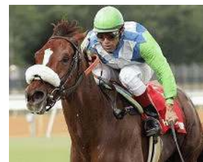
Showing Up

Go Between has the edge on Showing Up as far as experience on the green stuff goes, having made eight of his nine starts on the grass. He rallied to finish third behind Showing Up in the Turf Cup, but ran a career best last time, notching the GII Virginia Derby July 15.