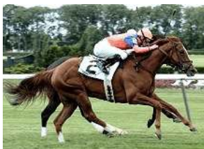
Gorella

Gorella held her own against the boys last season, placing a solid third behind Artie Schiller in the GI Breeders' Cup Mile at Belmont Park Oct. 29. The chestnut kicked off her four-year-old campaign with a Keeneland allowance tally Apr. 19, then ran a close fifth behind GI Arlington Million hopefuls English Channel and Cacique (Ire) in the GI Woodford Reserve Turf Classic S. at