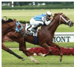
Go Deputy