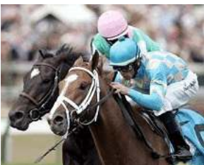
Cacique & English Channel in the Turf Classic