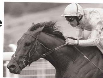
Gordon Stakes winner Sixties Icon is another Classic contender for his sire Galileo