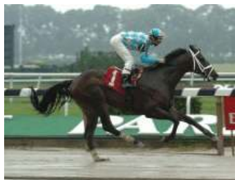
Scat Daddy

They were all the rage last year, but this year it's kind of hard to remember who they are--a fate that could