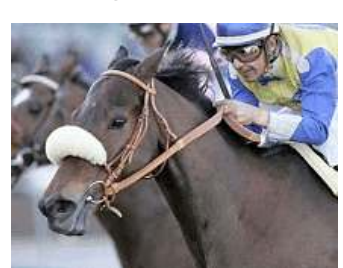
The Tin Man

Entries have been taken for Saturday's Arlington International Festival of Racing. The day's showcase is the GI Arlington Million, which has attracted an interna-