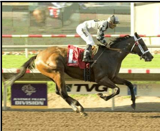
UNTOUCHED TALENT

Barretts ® EQUINE LIMITED A Fairplex Company (909) 629-3099 www.barretts.com