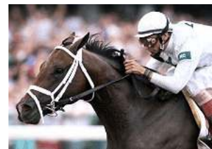
Bluegrass Cat

Bluegrass Cat and Untouched Talent are by a horse whose achievements have made him America's highest-priced stallion by a considerable margin. And both are out of very well-connected mares.