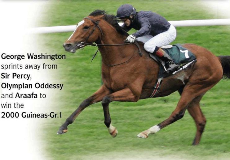
George Washington sprints away from Sir Percy, Olympian Odessey and Araafa to win the 2000 Guineas-Gr.1

What it all comes down to is this - if you are not using a Coolmore sire, ask yourself or your advisors, why not?