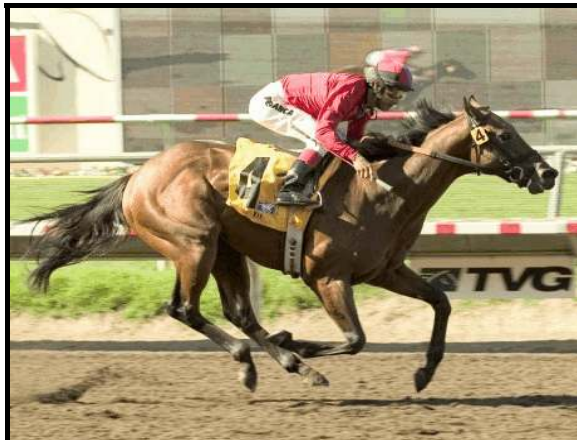
PRIME RULER