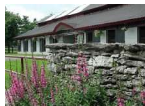
Taylor Made Yearling Complex