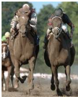
Spun Sugar (inside)