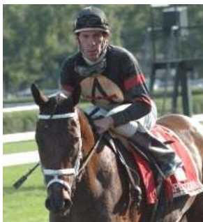
Spun Sugar

A # will distinguish first-time stakes-winners, a @ will indicate first-time graded stakes-winners, a ▲ will denote a first-time Grade/Group 1 winner, a + will first-time starters, an (S) will be used for state-bred races, a (C) will be used for maiden-claiming races and an (R) will be used for other restricted races. Purses for Canadian races are in Canadian dollars.