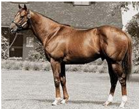
Distorted Humor www.stallionregister.com