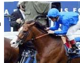
Electrocutionist at Ascot