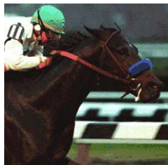
Mr. Greeley... SIRE OF SIRE El Corredor, G1 Winner and Leading Freshman and Sophomore Sire