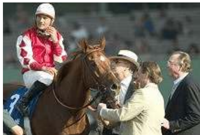
Fourty Niners Son

So why should Distorted Humor do any better? Perhaps the crucial factor is that his dam is a Grade II-winning daughter of Danzig, a stallion to whom European racing owes a huge debt. It is also encouraging