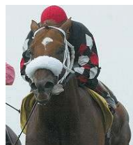
Diabolical at MTH

Diabolical was a good second behind Exclusive Quality in the Apr. 1 Spectacular Bid S. at Gulfstream, then romped by 8 1/4 lengths versus Delaware allowance foes Apr. 25. The May 20 GI Preakness S. proved way too tough for Diabolical, but the chestnut rebounded smartly from that eighth-place finish with an allowance win over the Monmouth sod June 29. Heavily favored to notch this off-the-turfer, he broke on top, set :24.38 and :48.93 fractions and won going away.