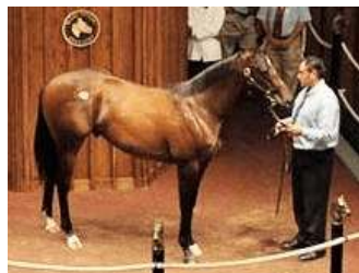
Hip 217