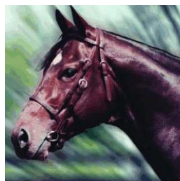
OFFICER Dominant 2YO, Champagne S.-G1, etc.