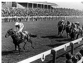
Dahlia

When Charming Alibi was bred to Secretariat in his first season, she produced a colt--Canadian Bound--who raised the record price for a yearling to $1,500,000 in 1976. Golden Alibi also sold well, making $1,100,000 as a yearling in 1979, but she never raced.