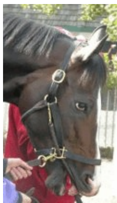
Silver Train