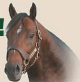
A.P. Indy -G1W Macoumba, by Mr. Prospector

Ivory Mint, dam of Malibu Mint, is back in foal to Malibu Moon