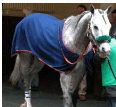
Too Much Bling Sherackatthetrack

Too Much Bling has really come into his own this season. The gray began his sophomore campaign with victories in the San Miguel S. Jan. 8 and the GII San Vicente S. Feb. 12. He shipped to the Big A for the GIII Bay Shore S. on the Wood Memorial undercard and defeated Songster by nine lengths in the sloppy going. The Darley colorbearer turned the tables in the GII Woody Stephens Breeders' Cup S. June 10, but Too Much Bling won't be facing anyone of his caliber here. Northern Soldier enters this contest a perfect three-for-three. The bay was last seen taking Hollywood's GII Lazaro Barrera Memorial S. May 20. Third-place finisher Arson Squad returned to take last weekend's GII Swaps S. Yes He's The Man has never tasted defeat over the Calder main track in three attempts. He returns from a Monmouth stint, where he won the May 20 Select S., then finished second in the Gilded Time S. June 11.