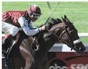
Dubai Escapade

Dubai Escapade (Awesome Again) will try and follow in her big sister's footsteps when she bids for her sixth consecutive victory in today's G1 Princess Rooney H. at Calder.