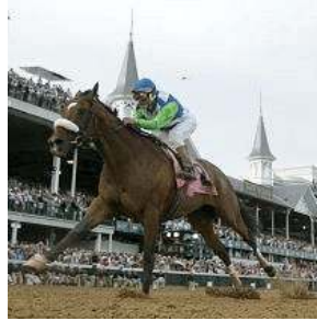
Barbaro winning the Derby