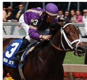
High Cotton Sherackatthetrack

Sayhellotolarry was rated off a soft pace in the Northern Dancer and finished an even third, but could benefit from faster fractions here. Flashy Bull , third in the GII Fountain of Youth S. in March, was off the board in the Apr. 1 GI Florida Derby and May 6 GI Kentucky Derby, but held on for third after dueling for the lead in an allowance at Belmont June 22.