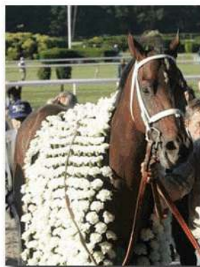
JAZIL 1st G1 Belmont S.