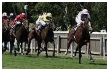
Sander Camillo Getty Images

Sander Camillo tore apart a seemingly competitive field assembled for this significant signpost to the following year's Classics to stamp herself in a class of her own.