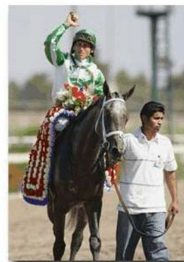
WAIT A WHILE 1st G1 American Oaks

YOUR NEXT OPPORTUNITY: FASIG-TIPTON SARATOGA KEENELAND SEPTEMBER