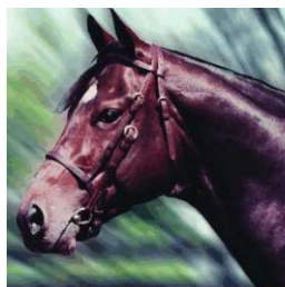
OFFICER Dominant 2YO, Champagne S.-G1, etc.