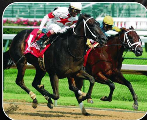
Chart / Video

2YO RICHWOMAN remains undefeated after edging out Chagall in Churchill's Debutante S.-G3