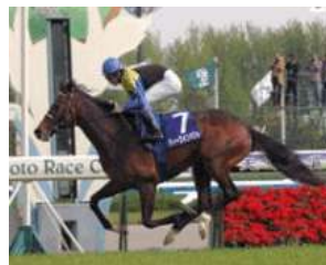
Deep Impact

The Japan Racing Horse Association's Select Sale began yesterday at Northern Horse Park in Hokkaido, with a colt from the family of reigning Japanese Horse