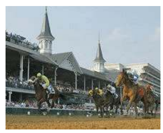
Seek Gold (outside)

Fresh off his stunning 91-1 upset in the GI Stephen Foster H., Bowman Couch Racing LLC's Seek Gold (Touch Gold) takes his show on the road, crossing the