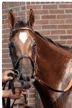
Bushfire

Louis Quatorze started his four-year-old season as if he might be better than ever, his first two starts resulting in wins in the GIII Creme Fraiche H. and GIII Ben Ali S., which he took by 13 lengths. Unfortunately, he then suffered an injury, and the Ben Ali proved to be his farewell.