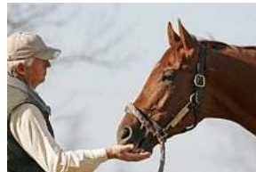
Strong Contender

Strong Contender (Maria's Mon) lacked the earnings and experience to make the Triple Crown races, but the handsome chestnut looks to jump start the second half of the sophomore season against five rivals in today's GII Dwyer S. at Belmont Park.