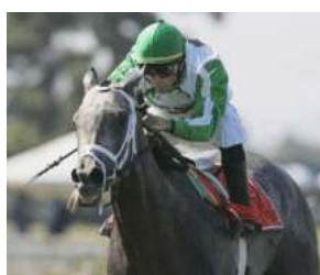
Wait a While

Wait a While (Maria's Mon) overcame a cross-country sojourn and a claim of foul to secure her first Grade I