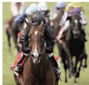
Dylan Thomas

Yesterday's G1 Budweiser Irish Derby had an open look beforehand, but it was clear cut as soon as Kieren