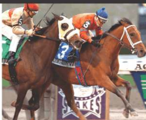
2006 Graded SW MAGNOLIA JACKSON.