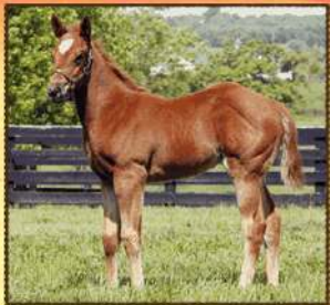
2006 Speightstown - Cedar Knolls filly bred by Beechlen Farms, LLC

Wait a While proved she loved the mud, winning three of four starts over the soft going, but was somewhat of a unknown quality on the grass. The Arindel Farm representative kicked off the year with a 14-length romp in the slop in Gulfstream's nine-furlong GII Davona Dale S. Feb. 4, but had to settle for third in the GII Bonnie Miss S. over that track and trip Mar. 5. Second to Saturday's GI Mother Goose S. heroine Bushfire in the GI Ashland S. at Keeneland Apr. 8, she came home a respectable fourth, but was moved up to third via disqualification, in the GI Kentucky Oaks May. 5. An easy winner in the off-the-turf GIII Sands Point S. at Belmont June 3, the filly was installed the 5-2 third choice for her first try on the grass as a sophomore. Settled off the pace in fourth, the filly took over turning for home and rolled home the easy winner. Click for the brisnet.com chart or the free brisnet.com catalogue-style pedigree . Video, sponsored by Taylor Made.